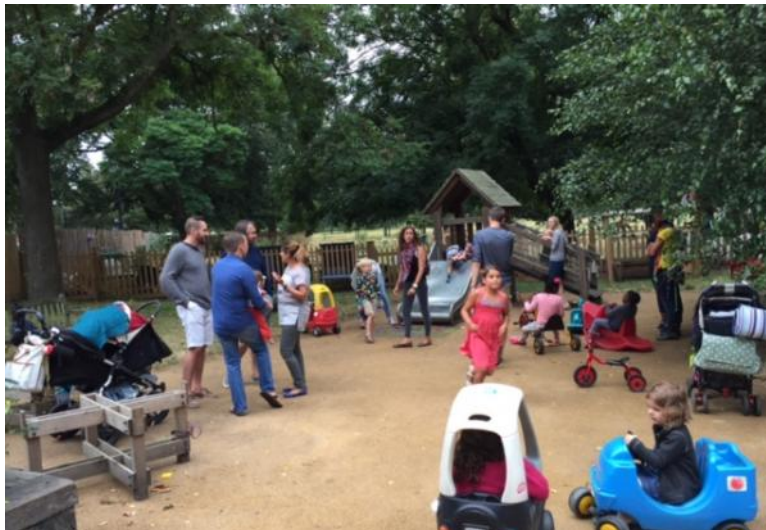
Having fun at the Spinney