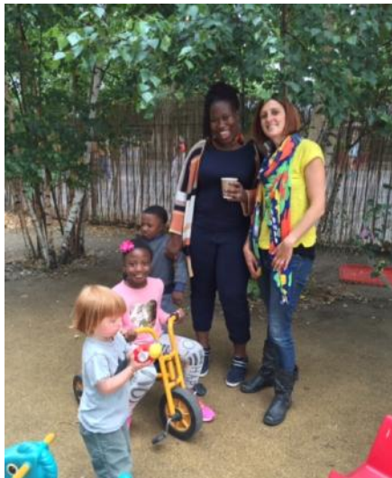
Getting to know each other